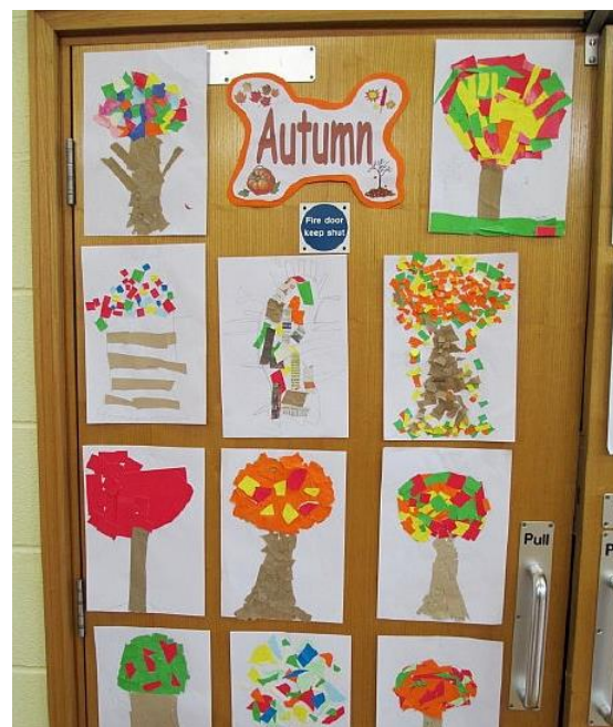
Autumn tree views.