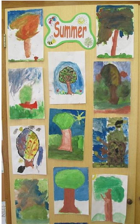
Summer tree views