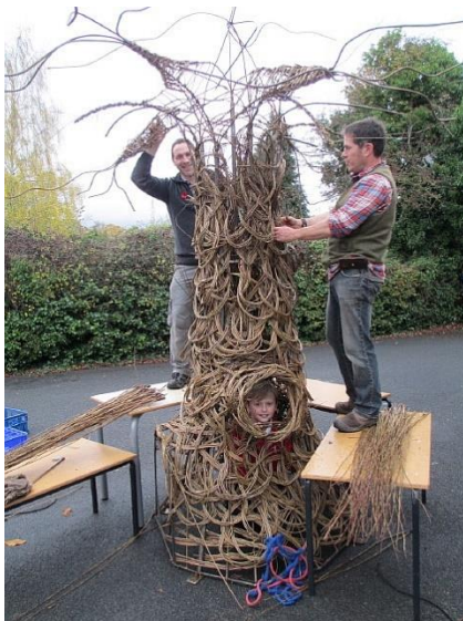
Blacksmith & Willow Worker building the tree

The Head Teacher emphasised how the Arts Week enhanced the school curriculum and stimulated the children's curiosity in areas such as science, maths, written English and citizenship. Below are some of the images from the event.